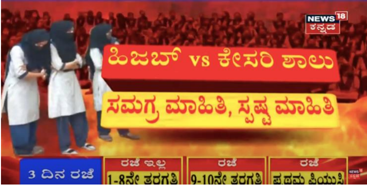
Image 4 - Screenshot of visuals displayed by News 18 Kannada clearly pitting Hijab wearing students against Saffron Shawl students, and framing the issue as “Hijab vs Saffron Shawl”.

In another instance, a BJP MLC is allowed to state—without objection from the anchor—that if we allowed them to wear the hijab, they will ask us to allow them to do the namaz five times a day and to go to mosques on Fridays. 127 It is worth noting that the visuals of this show pit the hijab-clad girls against the saffron-clad students.