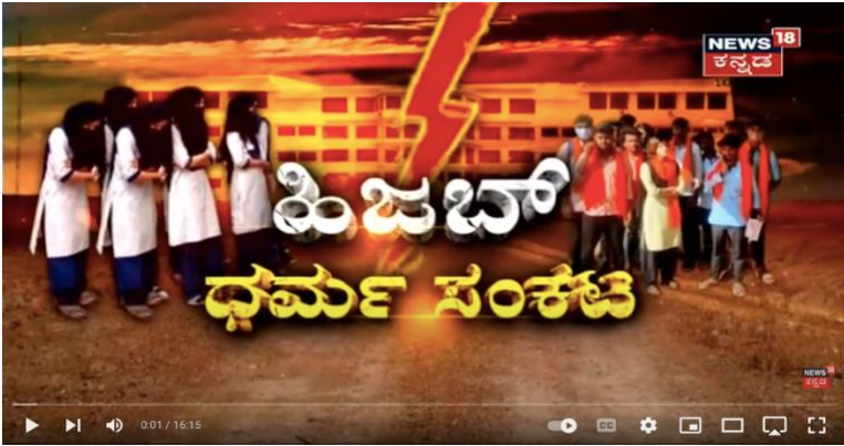
Image 5 - Screenshot of graphics displayed by News 18 Kannada pitting Hijab wearing students against Saffron Shawl students and presenting it as “A Dharam Sankata”