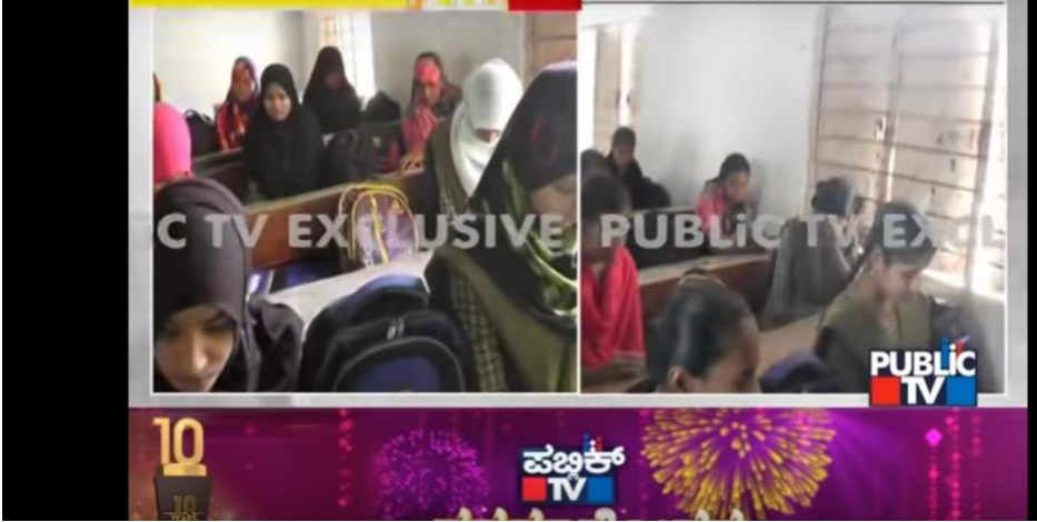
Image 6 - Screensbot of Public TV disrupting class and violating the privacy of minor girls.

ಪಬ್ಲಿಕ್ ಟಿವಿ ವರದಿ ಬಳಿಕ ಎಚ್ಚೆತ್ತು ವಿದ್ಯಾರ್ಥಿಗಳು ಧರಿಸಿದ್ದ ಹಿಜಬ್ ತೆಗೆಸಿದ ಶಿಕ್ಷಕರು | Public TV