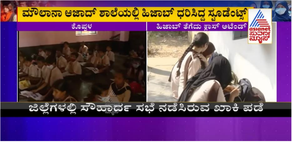
Image 9 - Screenshot of Asianet Suvarna show casing minor students faces. Headlines are “Hijab wearing students in Maulana Azad School”

Safety concerns and rights to privacy and dignity were repeatedly violated by media channels. For instance, in this report, Public TV repeatedly displayed faces of minor students.