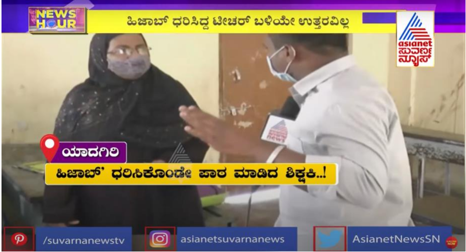
Image 8 - Screenshot of Asianet Suvarna Reporter ambushing a teacher in school premises. Headlines translate to “Hijab wearing teacher has no explanations”... (for wearing the hijab)

News reports emerged of TV channels targeting Muslim minority government schools and forcing school and college authorities to coerce their students, and in some cases even teachers, to remove their hijabs. 135