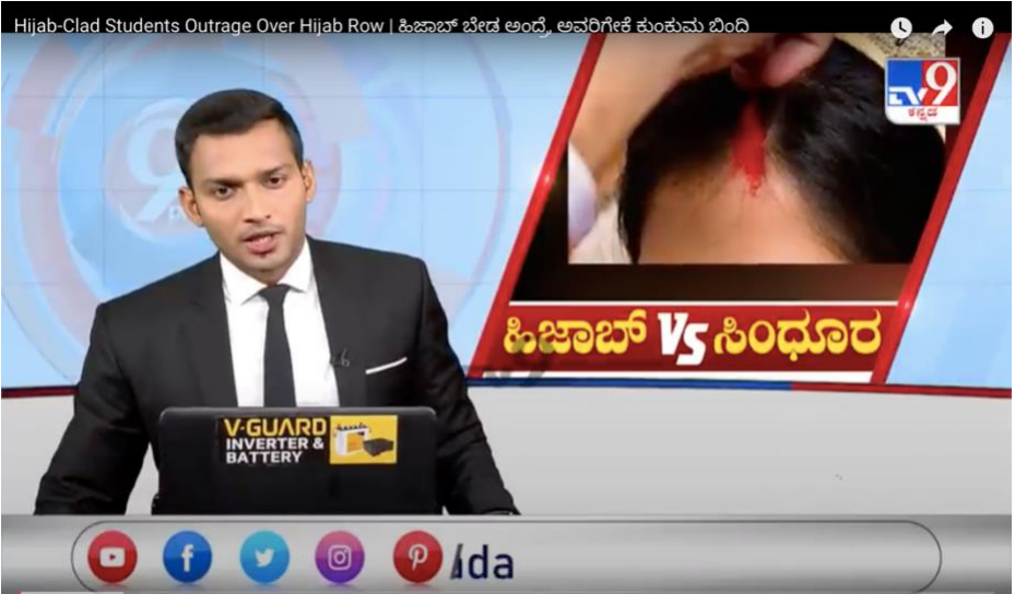
Image 7 - Screenshot of TV9 Kannada framing the issue as “hijab vs sindhoor”

In a seven-minute news video, 131 TV9 Kannada aired repeated sound bytes of hijab-wearing students raising the issue of hypocrisy, whereby Hindu students are allowed to wear bindis, bangles and celebrate Hindu festivals in educational institutions but Muslim students are not allowed to wear the hijab. The anchor begins by saying these questions are taking us in ‘another direction’. While he does not explicitly state what this direction is, the channel chose to air bytes from central and state ministers who substantiate the channel’s framing of the issue as ‘Hijab vs Sindhoor’ and as questioning the Hindu way of life.