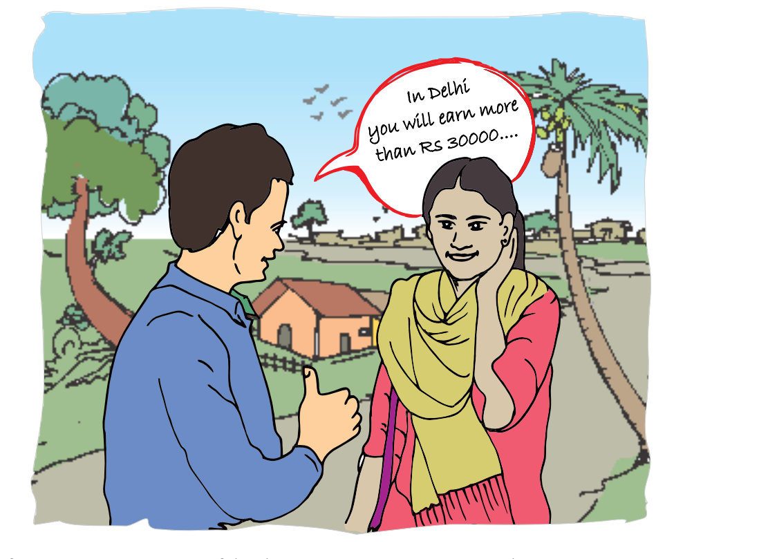
Traffickers often paint a rosy picture of the destination state/country in order to entice victims.

Stakeholders, in the absence of access to information, often carry out their functions without establishing necessary linkages and coordination between each other. This hinders effective justice for survivors/victims of trafficking and also hampers the criminal prosecution process. For example, in many cases, victims/survivors are traumatized, are fearful of speaking out against the perpetrators and are wary of engaging with the criminal justice system. They need counseling services to prepare them for the rigors of trial. Often, the families of rescued victims are responsible for trafficking of the person, and there is a great danger of further re-victimizing the survivor when the police or courts repatriate him/her to her family. Shelter homes can provide the necessary support in such cases. Knowledge about the contact details of both private funded and state funded shelter homes is a necessity.