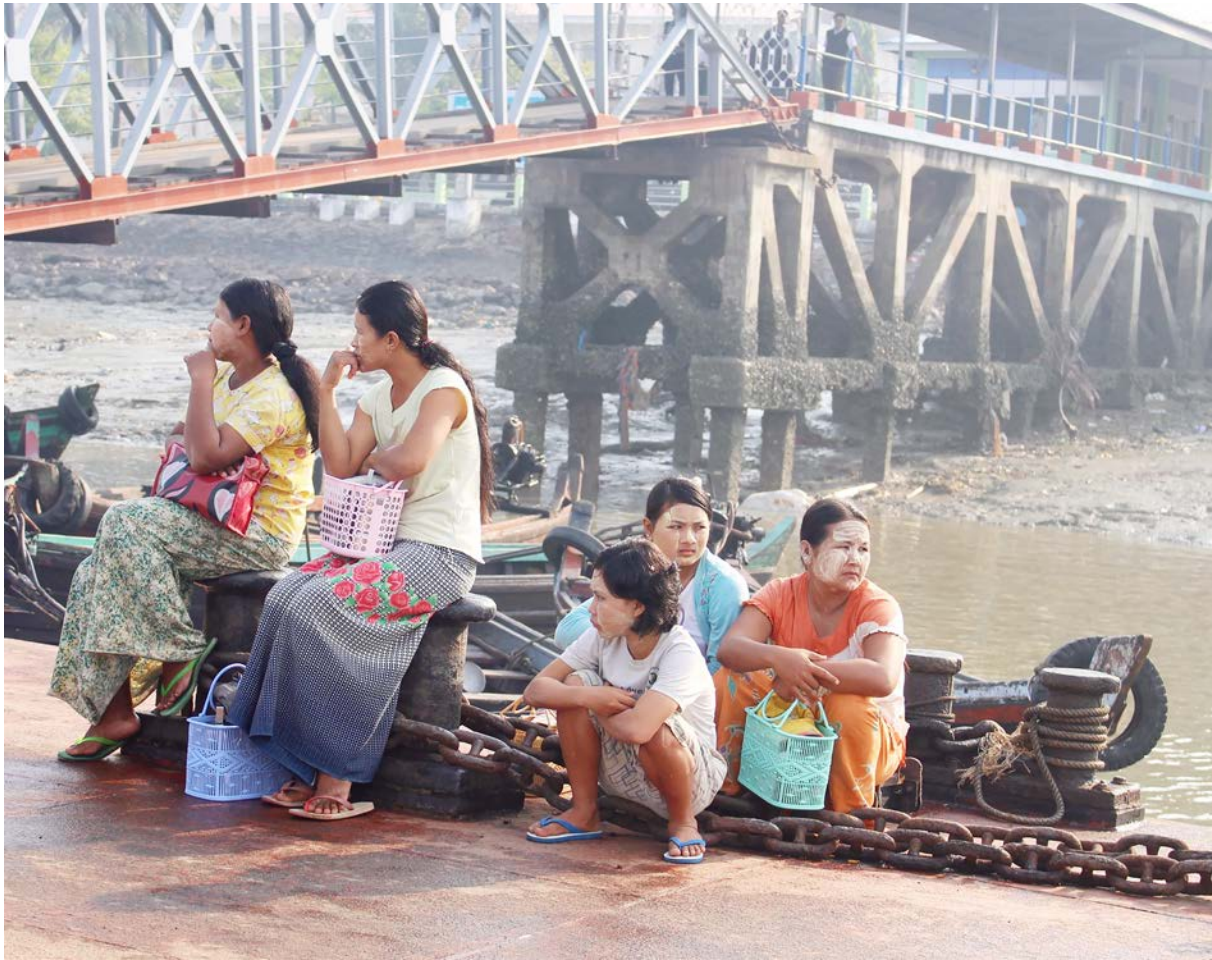
Women at the harbor, Myeik (Tanintharyi Region)

being without birth registration because applicants are not able to provide this information if they are without citizenship documentation or are a single parent. This hinders these children's ability to prove their links to their parents and therefore inherit citizenship from their mothers (and fathers).