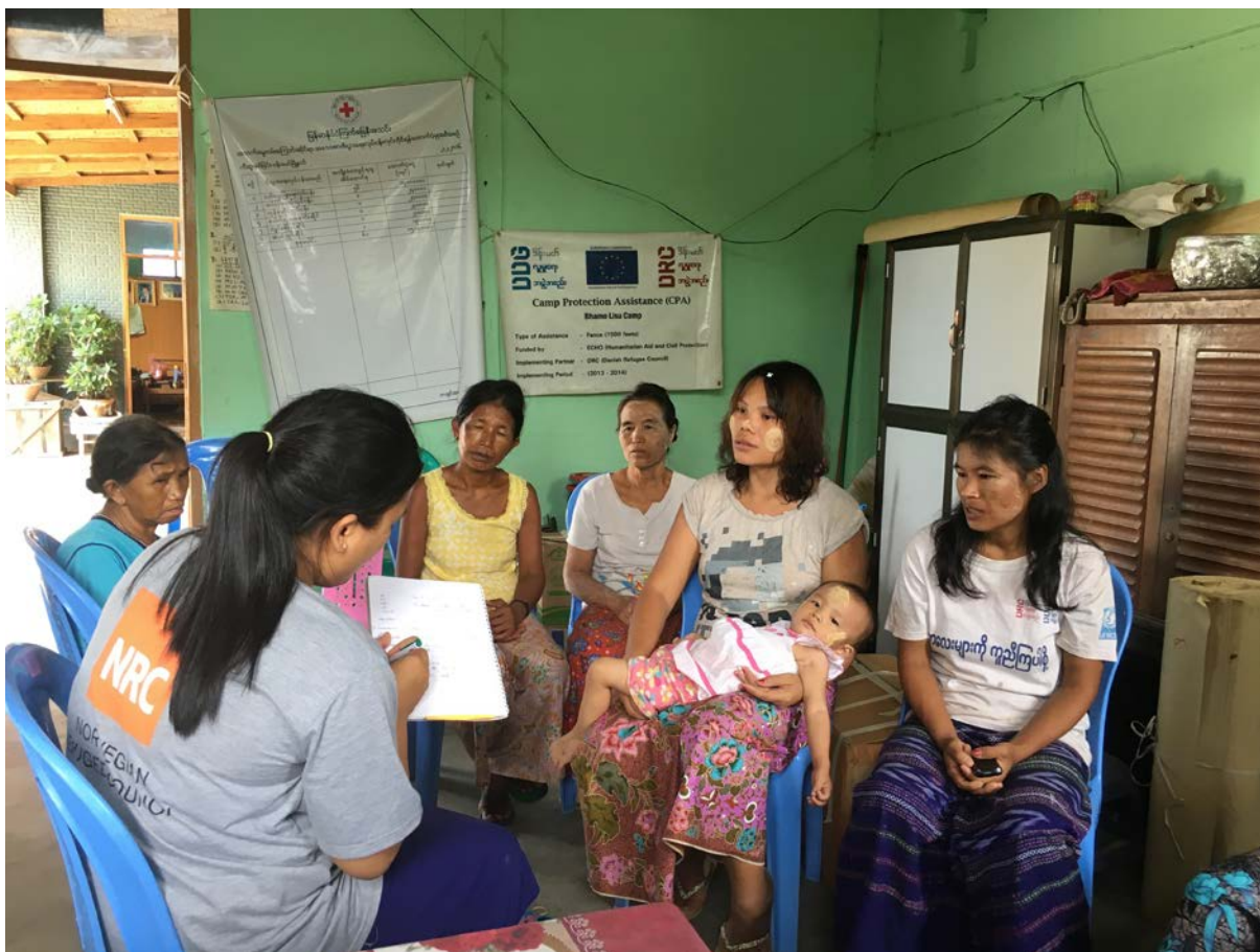
Counseling session with IDPs, Bhamo, Kachin State

the CEDAW Committee noted the limited available information as to the ability of women to acquire citizenship based on their marital status and ability to pass citizenship to their children born outside the country, as well as children with non-national fathers. 105 The Committee called upon Myanmar to “review the 1982 Citizenship Law and repeal or amend it, as appropriate”, in order to bring it into full compliance with article 9 of the CEDAW. 106 The Committee also called on Myanmar to provide more information on “Myanmar citizenship rights, including on birth certificates of children born in Myanmar, in particular children of ethnic groups, in its next periodic report”. 107