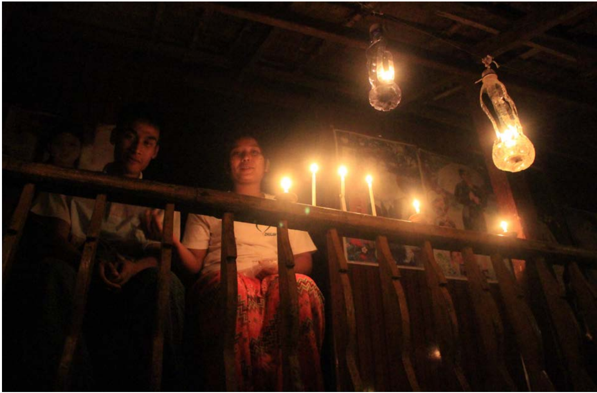
Family in Thayat Chaung, Tanintharyi Region

Fourth, a child whose name is included in one of their parent's NCSC is a "naturalised citizen". 62 Similar to a child whose name is added to one of their parent's ACSC (as discussed above), for a child whose name is included in their parent's NCSC, once they have reached 18 years of age they and their parents must make an affirmation in writing that they owe "allegiance to the State", will "respect and abide by the laws of the State" and are aware of the "prescribed duties and rights". 63 Again, if an affirmation is not made on or before the date in which the child of the NCSC holder reaches 22 years of age and no "sufficient reasons" are provided, then the child of the NCSC holder loses their "naturalised citizenship". 64 Fifth, a non-citizen spouse may acquire naturalised citizenship through marriage to a person with any of the three types of citizenship provided the date of marriage precedes the enactment of the 1982 Citizenship Law, 65 being 15 October 1982, and the non-citizen had been issued with a Foreigner's Registration Certificate. 66 Therefore a foreign spouse cannot acquire "naturalised citizenship" on the basis of their marriage to a Myanmar citizen, if the marriage is entered into after 15 October 1982.