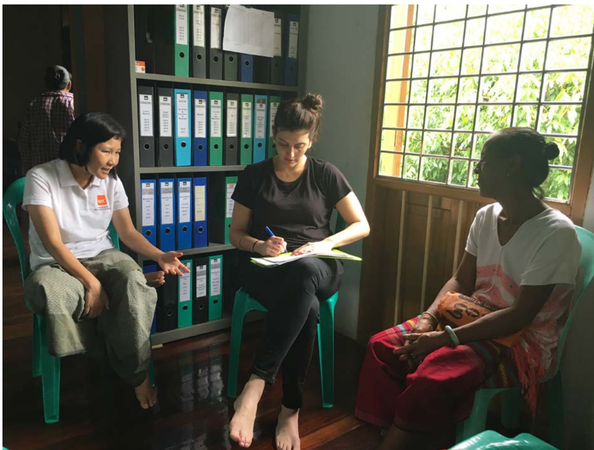
Interview in Thaton, Mon State

Additionally, the 1993 Child Law and the 1982 Citizenship Law requires children who are “citizens” by birth and children born to “associate citizens” and “naturalised citizens”, born either in or outside of Myanmar, to have their birth registered. 145 Late registration is also permitted. 146