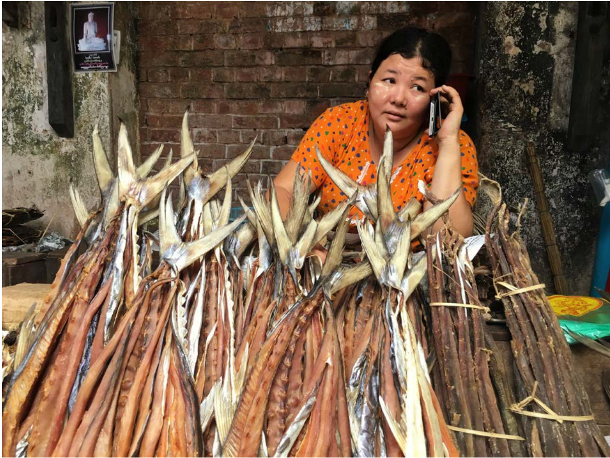
Fish market in Dawei, Tanintharyi Region

T his analysis has found that there are a number of barriers that women experience in acquiring, confirming and retaining citizenship and conferring citizenship to their children, which are contrary to Myanmar's obligations with respect to eliminating gender inequality, the right to a nationality, the right to birth registration and equal nationality rights between men and women. This may result from gaps in the 1982 Citizenship Law and 1983 Procedures, gender discriminatory domestic laws, barriers to birth registration, as well as gender norms in Myanmar society. Based on the above analysis a number of recommendations have been made that aim to ensure that Myanmar is in compliance with its international obligations. These recommendations include specific amendments to the 1982 Citizenship Law and 1983 Procedures, ensuring universal birth registration, repealing specific gender discriminatory laws enacted in 2015, providing practical assistance to female applicants for citizenship documentation, and fostering environments conducive to eliminating gender discrimination and the barriers experienced by women in acquiring, confirming and retaining citizenship.