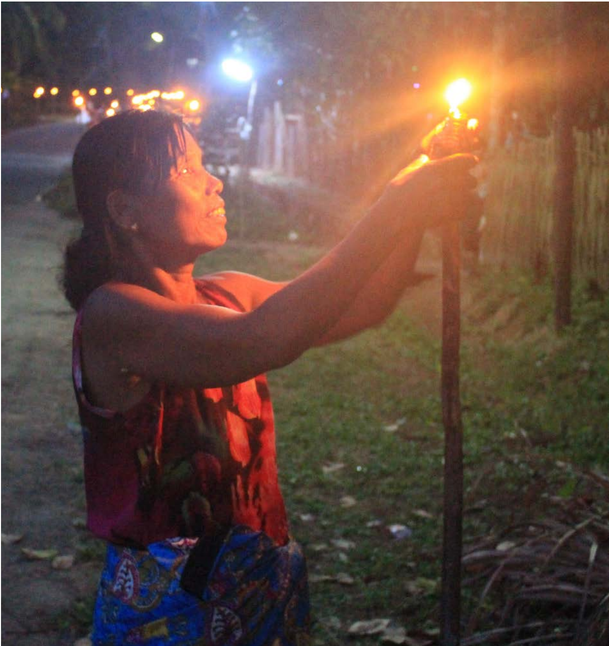
Preparing the Tadingyut Festival, Thayat Chaung, Tanintharyi Region

Alternatively, if the child is born to parents who are combination of a non-national and “associate citizen”, the child may be able to acquire “associate citizenship” if the “Central Body decides” to enter the name of the child into the ACSC of the “associate citizen” parent. 152 If the child’s name is not entered in the ACSC of the parent who is an “associate citizen”, then the child will not become an associate citizen and will only be eligible for “naturalised citizenship” pursuant to section 44 of the 1982 Citizenship Law. 153