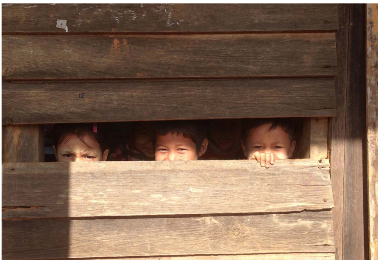
School children in Loikaw, Kayah State

Until 2017, the largest population of stateless persons globally were resident in Myanmar: the Rohingya of Rakhine State, estimated to be a population of approximately 1.1 million. As a result of a series of attacks against police posts on 25 August 2017 by the Arakan Rohingya Salvation Army (ARSA) and the subsequent military clearance operation, within four months almost 700,000 Rohingya refugees fled to and are now residing in Bangladesh. Around half of this refugee population are women, and 14% are single mother households.