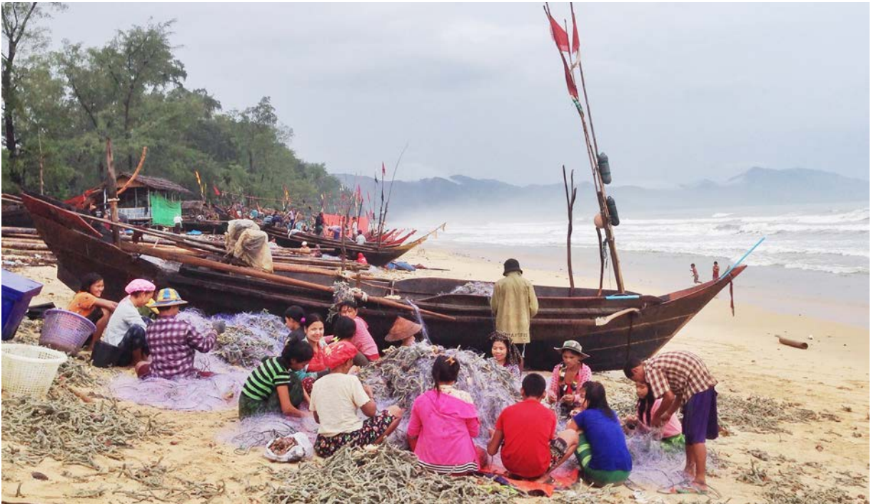
Fisher women cleaning the nets, Maungmagan, Tanintharyi Region

Recommendation 2: Provide practical assistance to applicants for citizenship, citizenship documentation, and birth registration. This would include the following: