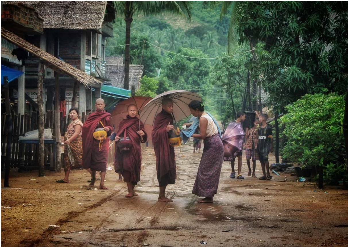
Woman and Buddhist Monks, Launglon, Tanintharyi Region