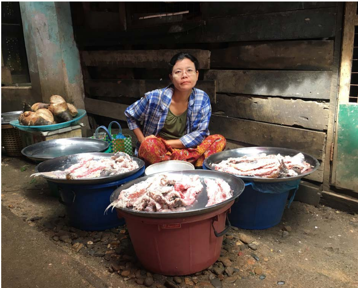
Market in Dawei, Tanintharyi Region

Participants in Yangon outlined that an applicant for birth registration (and a birth certificate) must provide the name and citizenship documentation identification number for both the child's mother and father. Participants advised that this results in a large number of children