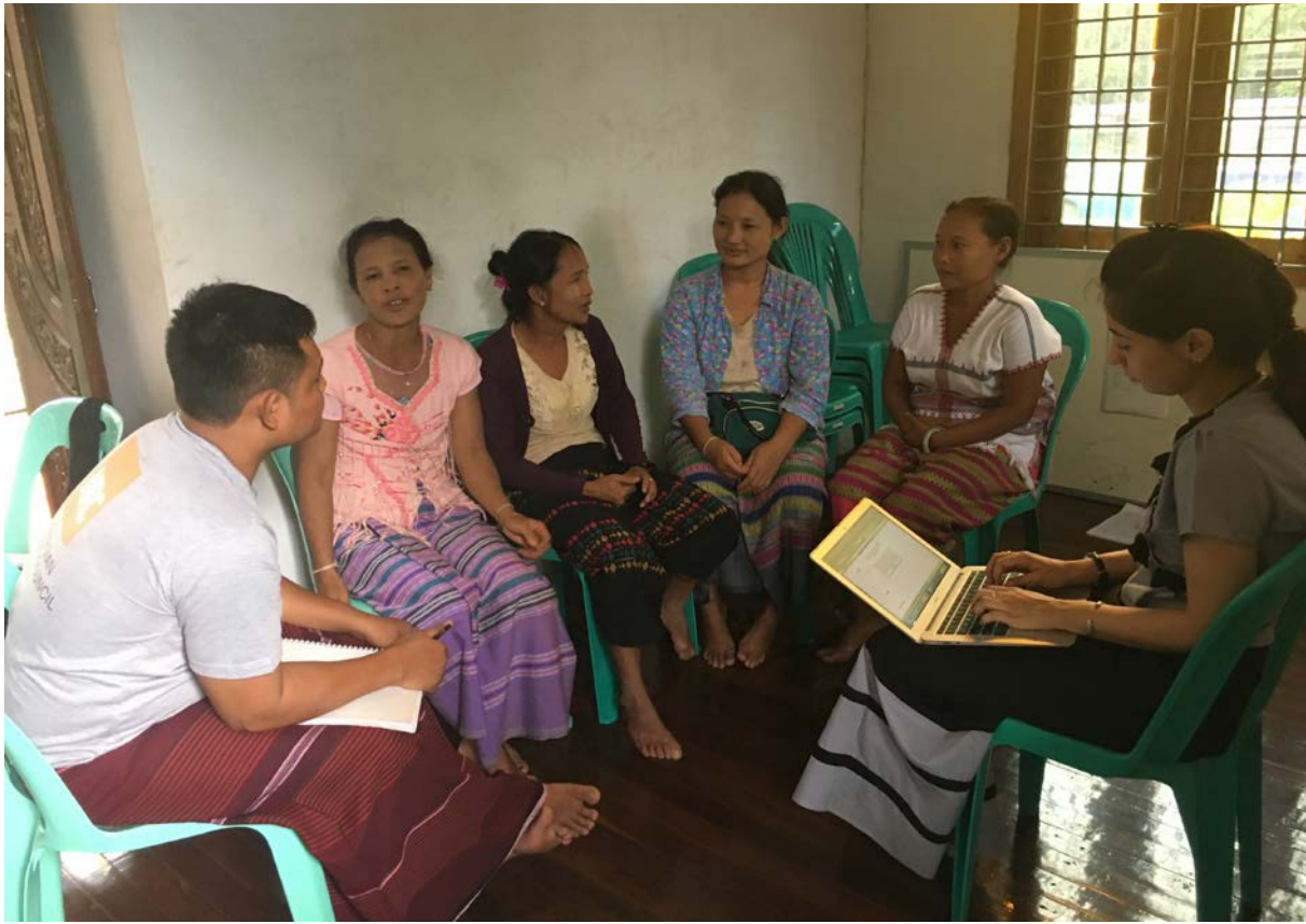
Focus Group Discussion with Karen women in Thaton, Mon State