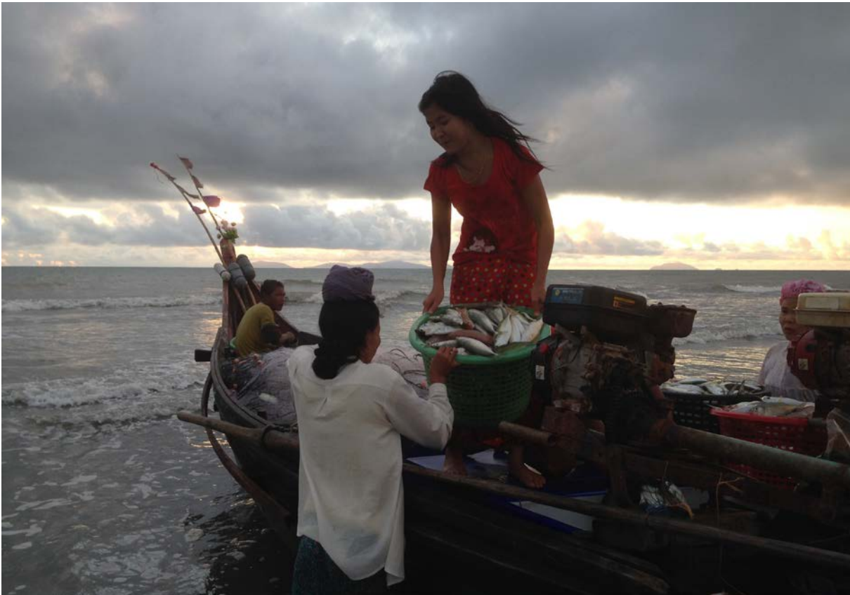
Fisher women in Maungmagan, Tanintharyi Region