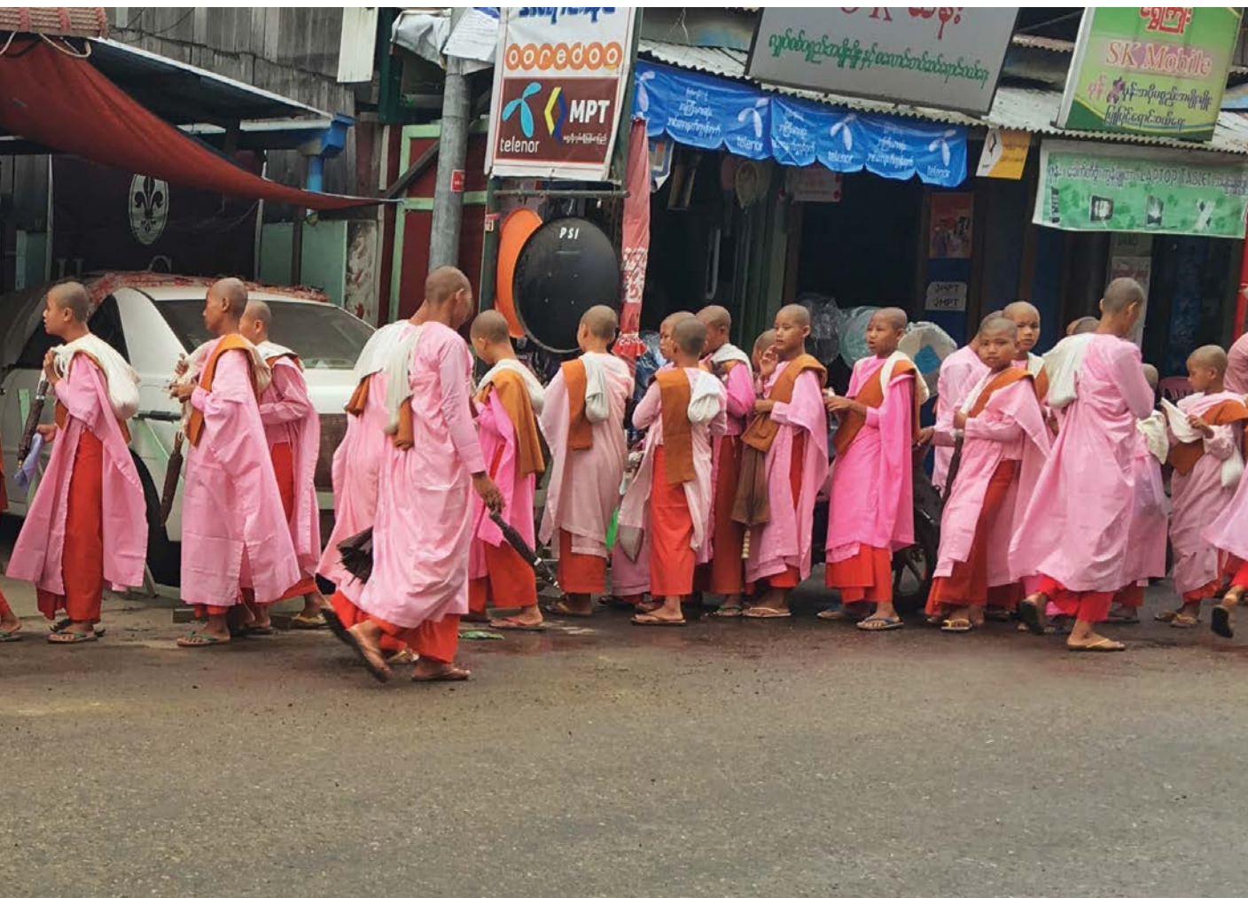
Nuns in Bhamo, Kachin State