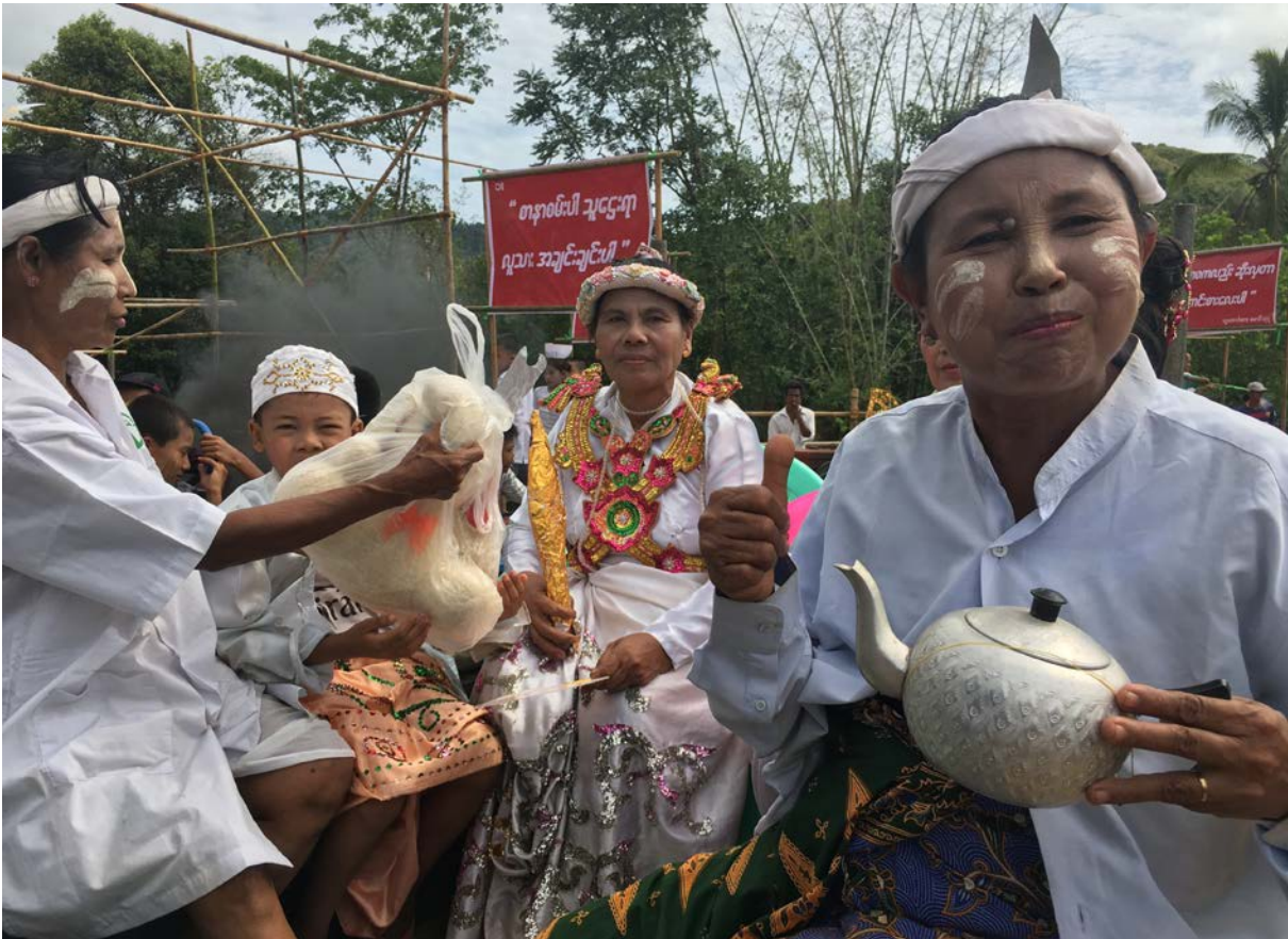
Kason Festival, Tanintharyi Region