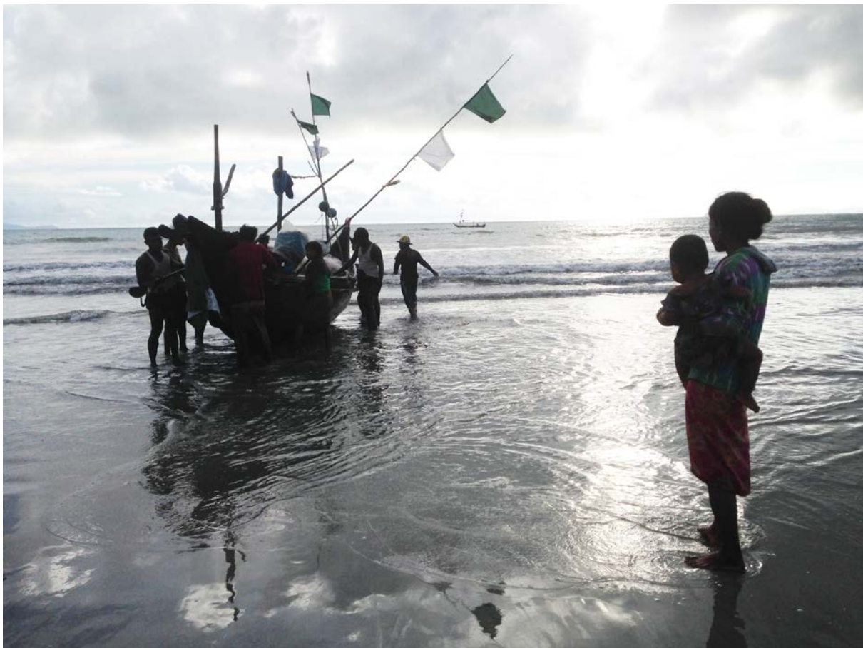
Fisher woman and child in Maungmagan, Dawei, Tanintharyi Region

The 1982 Citizenship Law does not allow for a Myanmar citizen to pass their “citizenship” or “associate citizenship” status on to their child if the child’s other parent is not a Myanmar citizen. 148 If the Myanmar authorities consider a non-national father or mother to be a “foreigner” as per the 1982 Citizenship Law, the child will only be eligible for “naturalised citizenship” if the Myanmar national mother or father is a “citizen” or “associate citizen”. 149 In such circumstances, the child who is eligible for “naturalised citizenship” will be required to fulfil the criteria for “naturalised citizenship” pursuant to section 44 of the 1982 Citizenship Law before acquiring or confirming “naturalised citizenship”. The criteria being that the applicant is eighteen years of age, is able to “speak well one of the national languages” and is of “good character” and “sound mind”. 150 A child who acquires “naturalised citizenship” via this mechanism will not enjoy the same rights that attach to “citizenship” or “associate citizenship”, as enjoyed by their Myanmar national father or mother. 151