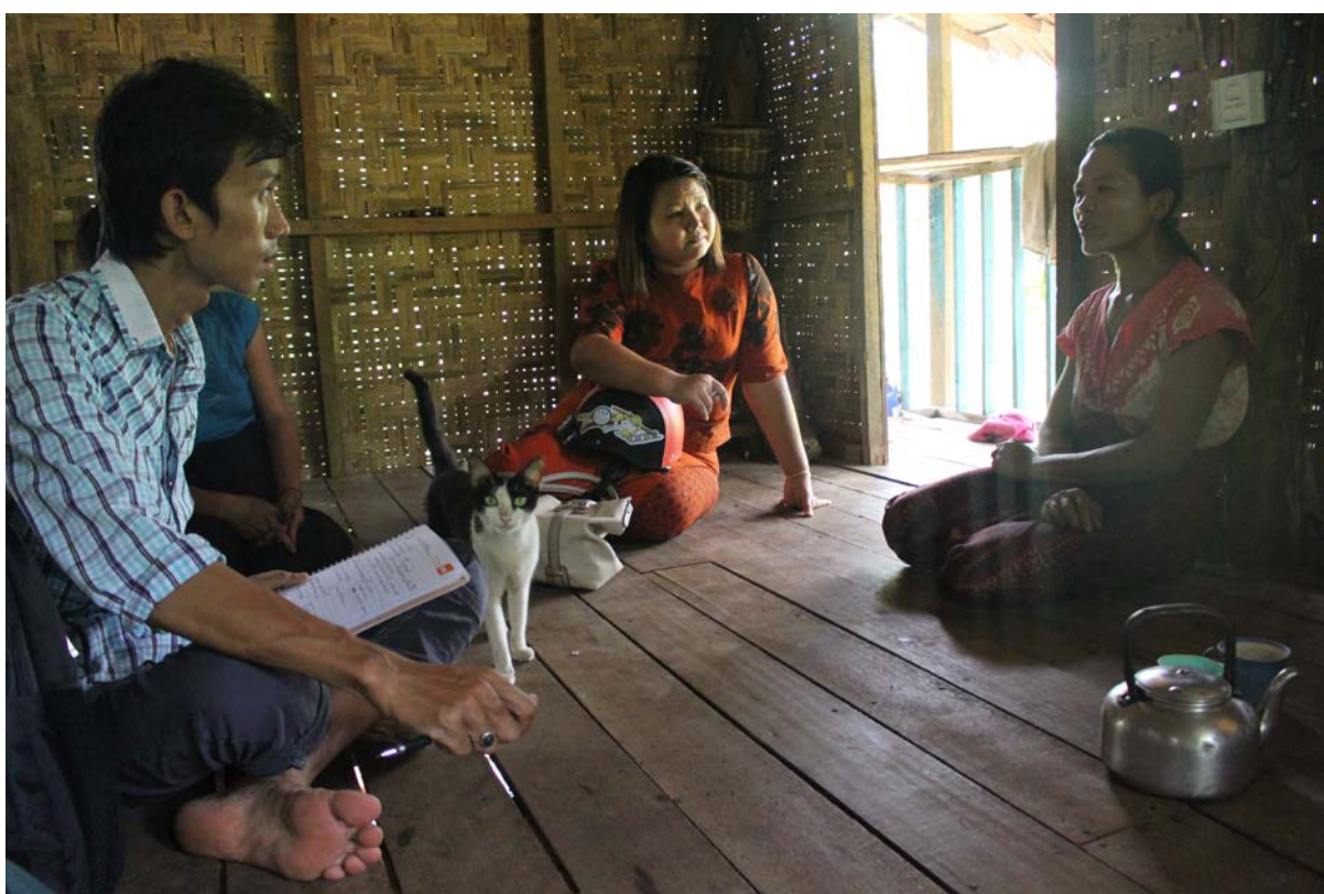
Counseling session in Palaw, Tanintharyi Region

“Naturalised citizenship” (type 3) can only be acquired by application by one of five criteria. First, persons who have entered and resided in Myanmar prior to 4 January 1948 (including their children born within Myanmar). 58 Second, a person born in or outside of Myanmar to one parent who is a “citizen”, “associate citizen” or “naturalised citizen” and the other parent is a “foreigner”. 59 Third, a person born in or outside of Myanmar to parents who are a combination of “associate” and “naturalised citizens” or both parents are “naturalised citizens”. 60 To be eligible for “naturalised citizenship” under the three aforementioned criteria, an individual must also be aged 18 years or over, be able to “speak well one of the national languages”, and be of “good character” and “sound mind”. 61