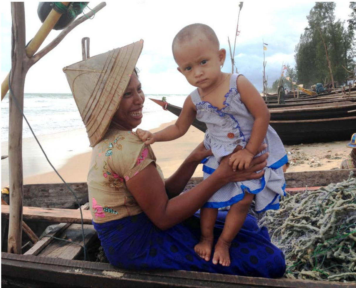
Woman and Child, Maungmagan, Tanintharyi Region (Jose Arraiza, NRC)

children”, 15 suppressing all forms of trafficking in women and “exploitation of prostitution of women”, 16 eliminating “discrimination against women in the political and public life”, 17 ensuring equal rights with men in the fields of education, 18 employment, 19 healthcare, 20 and other areas of economic and social life, 21 ensuring equality before the law, 22 and eliminating discrimination against women in “all matters relating to marriage and family relations”. 23