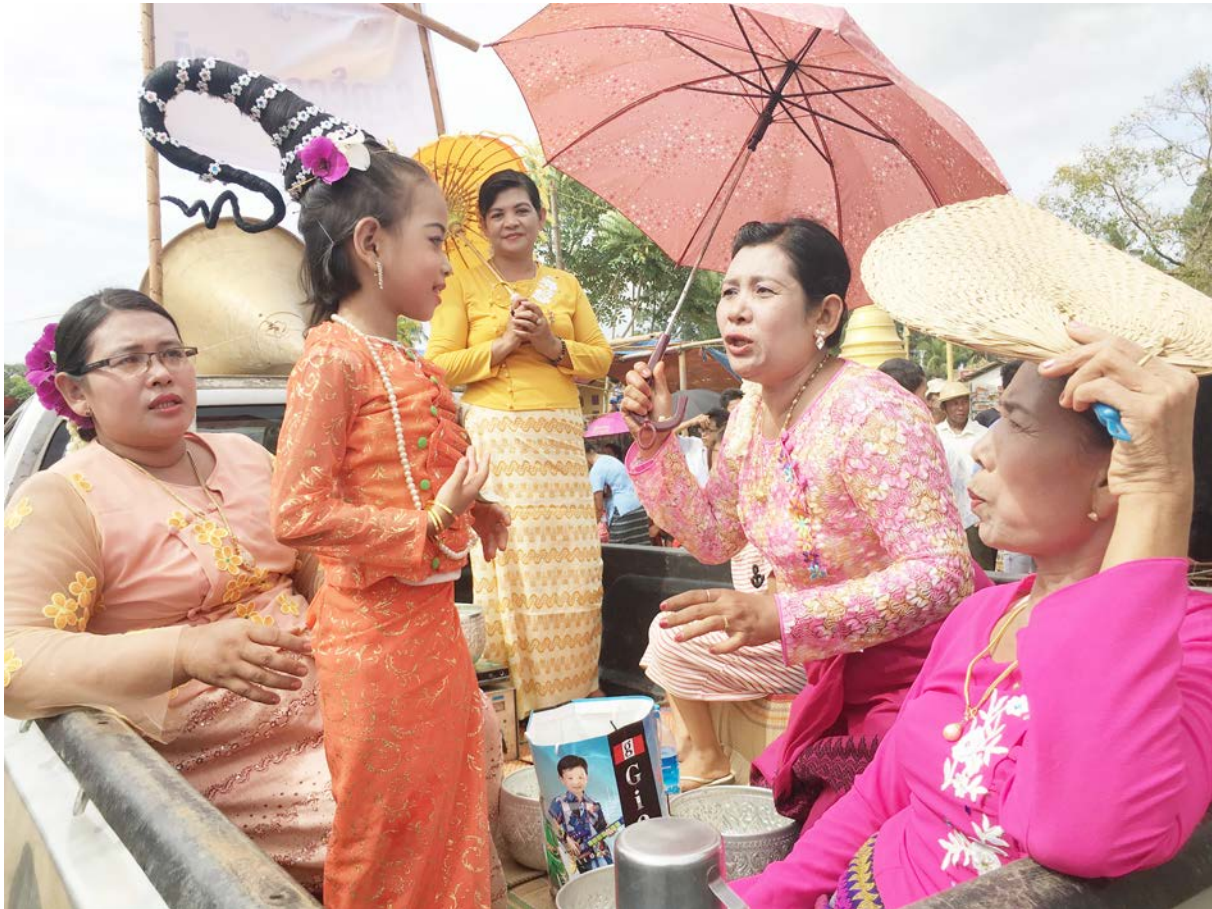
Kason Festival, Nyin Maw, Tanintharyi Region